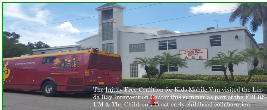
The Injury Free Coalition for Kids Mobile Van visited the Linda Ray Intervention Center this summer as part of the FDLRS-UM & The Children's Trust early childhood collaboration.

97% of parents and school personnel stated they were highly satisfied with our services and 97% said they would recommend the services to others.